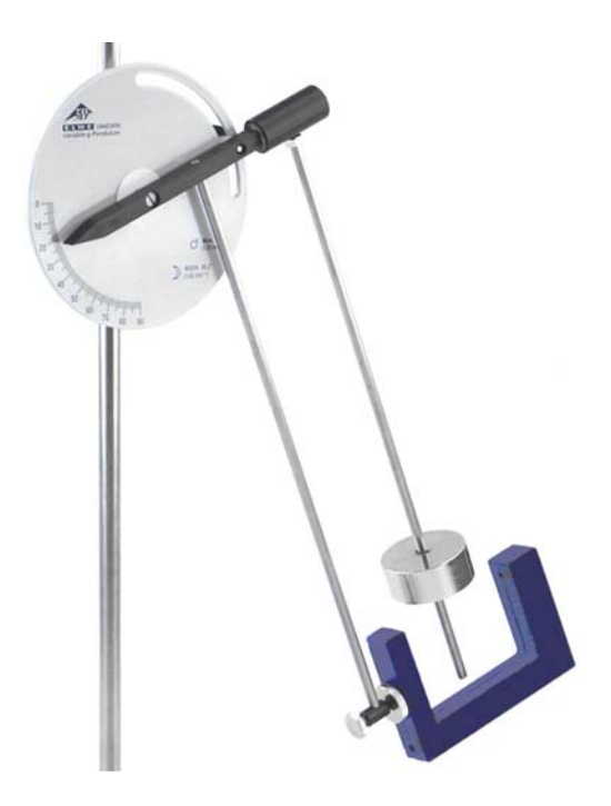
Fig. 1 Variable-g pendulum with mounting rod and photo gate

To measure the frequency or period of the pendulum, a photo gate (U11365) can be attached using the mounting rod (U8403955) as shown in Fig. 1.