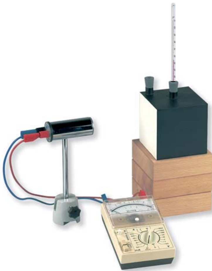
Fig 1 Experimental set-up

The black and white lacquered faces emit approximately equal amounts of infrared radiation. The reason for this is that white and black only appear as such within the visible light spectrum. If only the emitted thermal radiation is observed, which has longer wavelengths than visible light, both the white and black faces appear as so-called grey bodies; in other words, both radiate all wavelengths within this range with equal intensity. By contrast, the thermal emission of the metallic faces is much weaker.