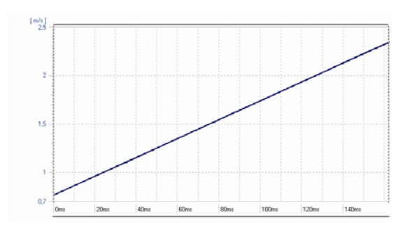
Fig. 3: Acceleration due to gravity against time