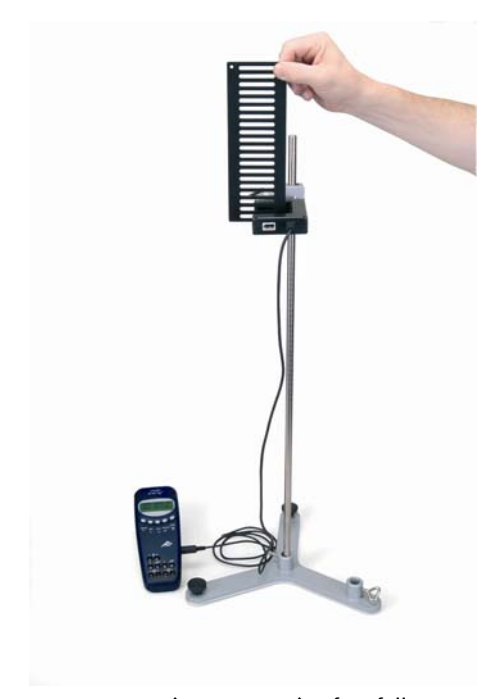
Fig. 1: Measuring free fall